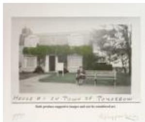
Allen Ruppersberg American, born 1944 The Top 10 Historical Similarities (and Differences) Between Prints and Photography , 2012 suite of 10 lithographs Gift of Landfall Press, Collection of Kansas City Art Institute