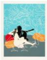
Nusra Latif Qureshi Pakistani, born 1973, based in Melbourne, Australia Gardens of Desire , 2003 lithograph Gift of Landfall Press, Collection of Kansas City Art Institute