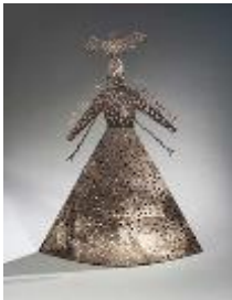
Lesley Dill American, born 1950 Rapture's Germination , 2010 lithograph and thread Gift of Landfall Press, Collection of Kansas City Art Institute