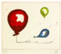
Claes Oldenburg American, born Sweden, 1929 Balloons , 2000 lithograph Gift of Landfall Press, Collection of Kansas City Art Institute