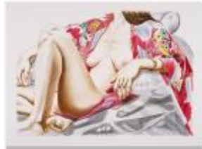
Philip Pearlstein American, born 1924 Model in Kimono on Plastic Chair , 2000 lithograph Gift of Landfall Press, Collection of Kansas City Art Institute