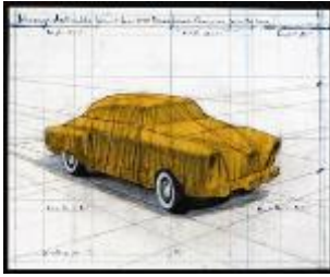
American, born Bulgaria, 1935 Wrapped Automobile, (Project for 1950 Studebaker Champion, Series 9G Coupe) , 2015 lithograph with collage Gift of Landfall Press, Collection of Kansas City Art Institute