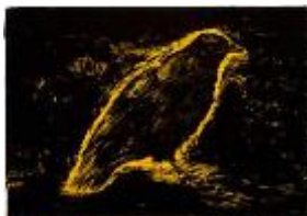
Jim Dine American, born 1935 Sun's Night Glow , 2000 lithograph Gift of Landfall Press, Collection of Kansas City Art Institute