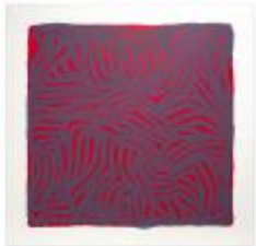
Sol LeWitt American, 1928-2007 Parallel Curves , 2001 lithograph and aquatint Gift of Landfall Press, Collection of Kansas City Art Institute