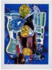
American, born 1946 Alignment , 2000 lithograph Gift of Landfall Press, Collection of Kansas City Art Institute