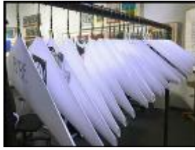
Pyre , 2016 suite of lithographs and wire hangers