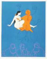
Nusra Latif Qureshi Pakistani, born 1973, based in Melbourne, Australia Three Songs of Devotion , 2003 lithograph Gift of Landfall Press, Collection of Kansas City Art Institute