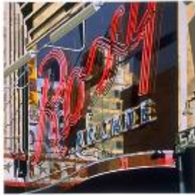
Robert Cottingham American, born 1935 Roxy , 2001 lithograph Gift of Landfall Press, Collection of Kansas City Art Institute