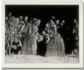
David Levinthal American, born 1948 Uncle Tom's Cabin , 1999 suite of 8 photogravures Gift of Landfall Press, Collection of Kansas City Art Institute